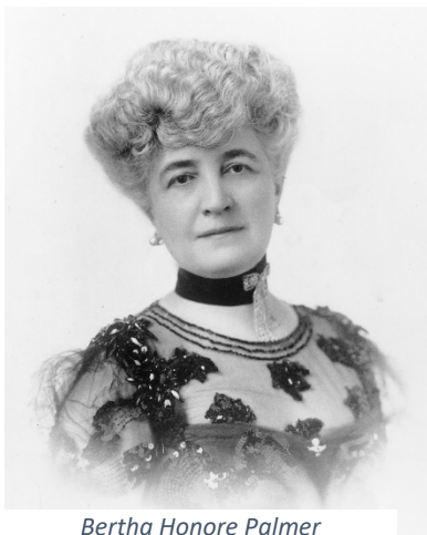
Bertha Honore Palmer

While some may think they know all there is to know about Palmer Ranch, we've hundreds of new residents on the ranch who may not be so familiar with the inner workings of the area, hence we feature this educational series every month. This month, we'll be learning the interesting history of how Palmer Ranch became to be the beautiful community we know today.